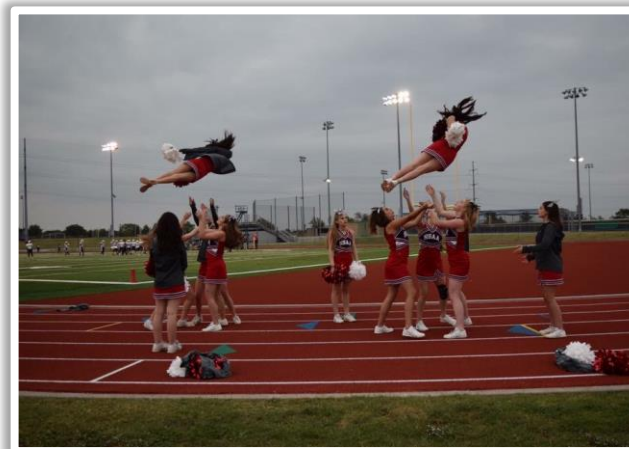
HSAA Varsity Cheer