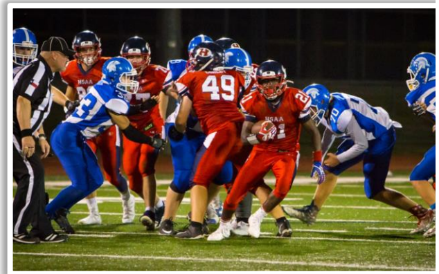
HSAA Varsity Football